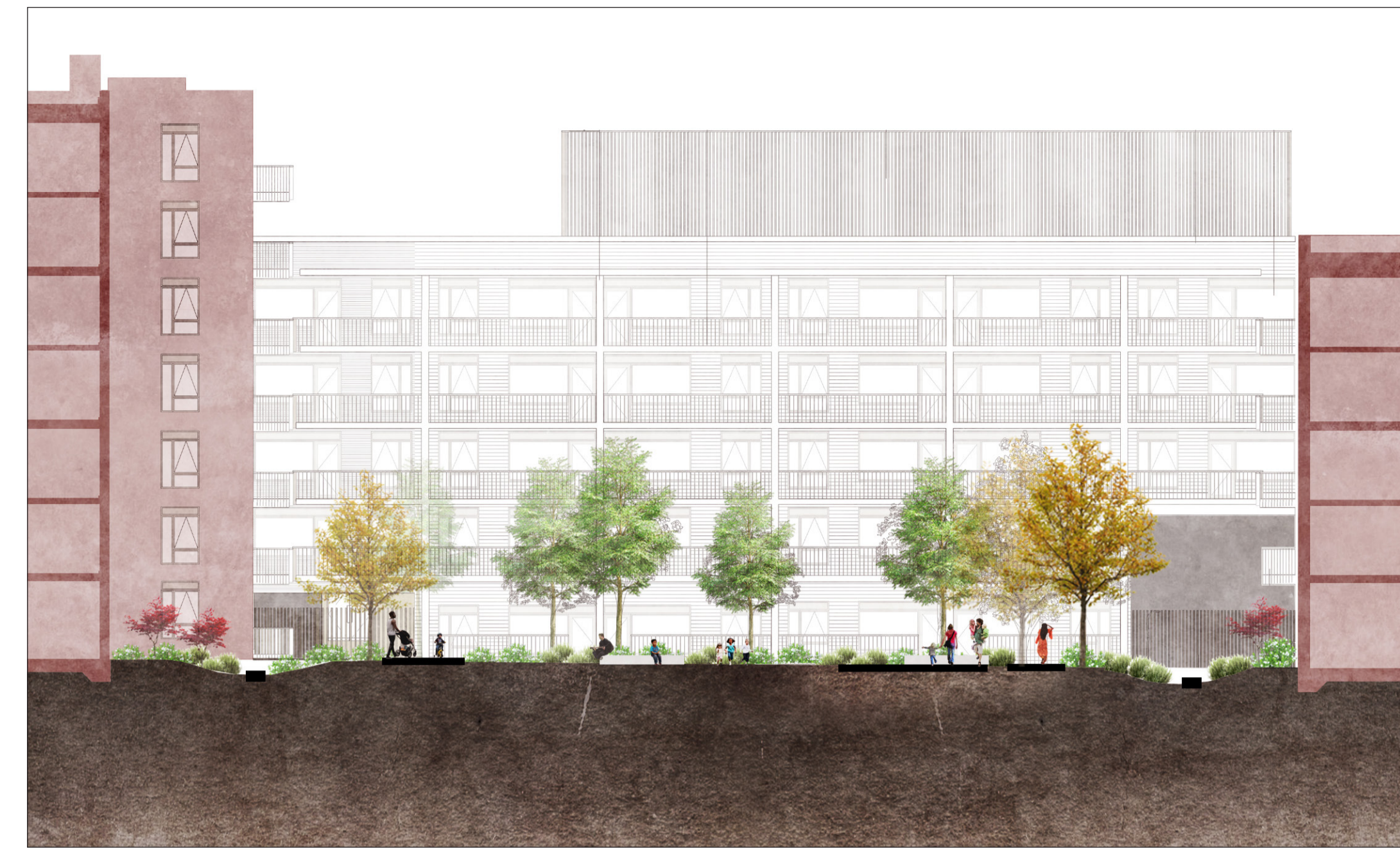
Section C: Residential Courtyard