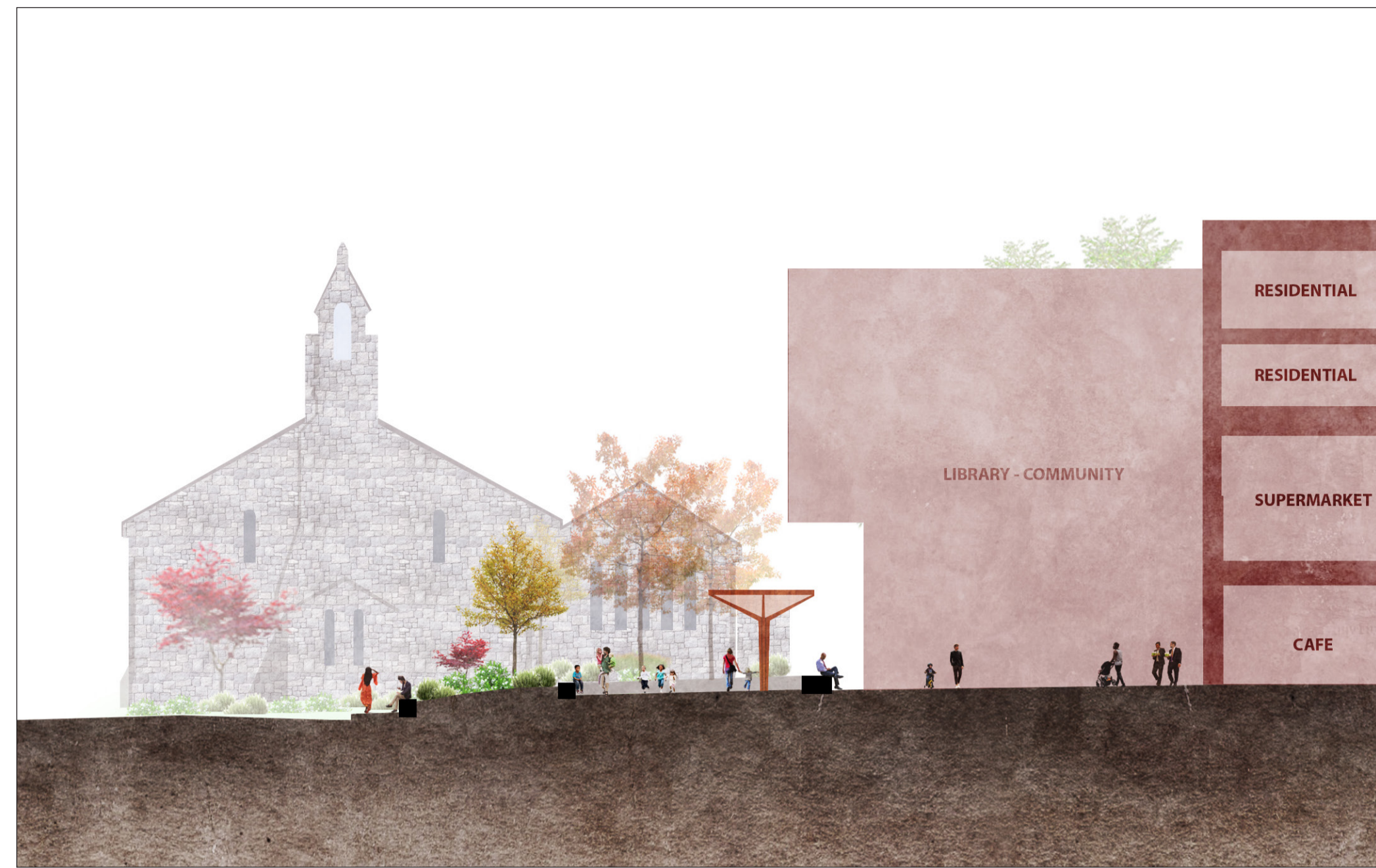
Section B: Emmet Place, at retail street