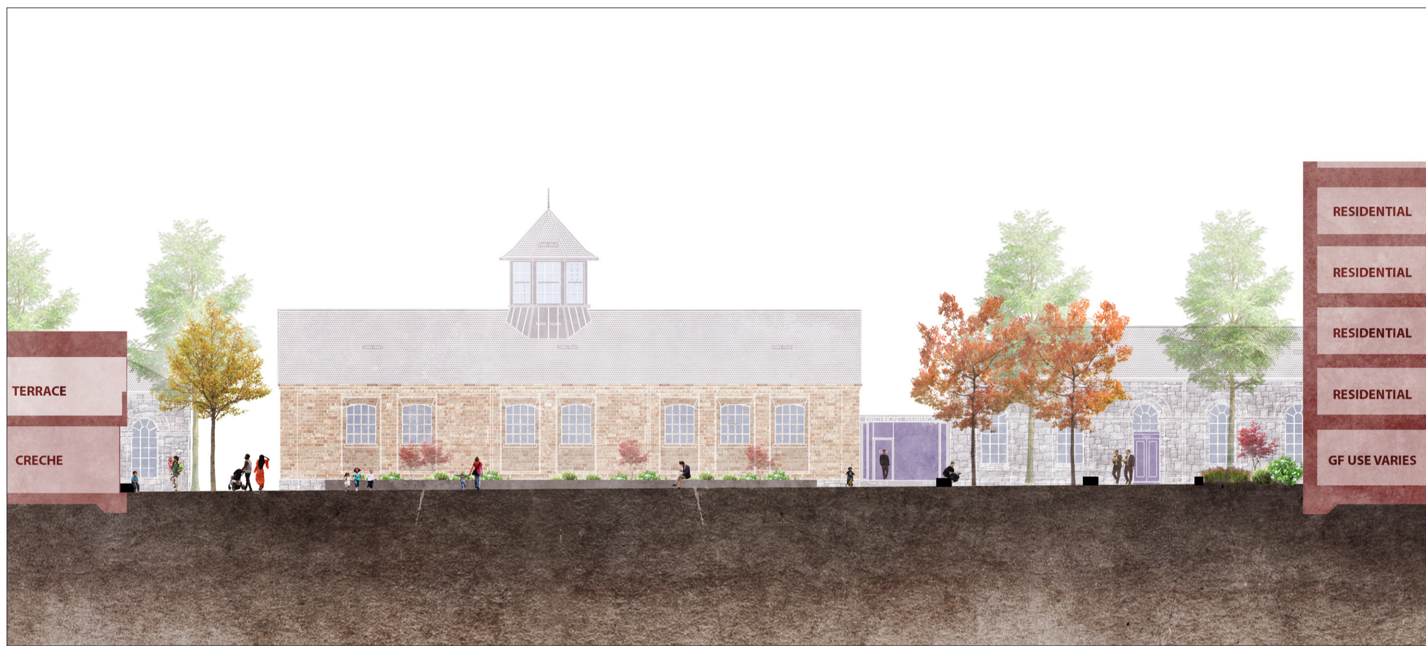
Section D: Richmond Place (Longitudinal)