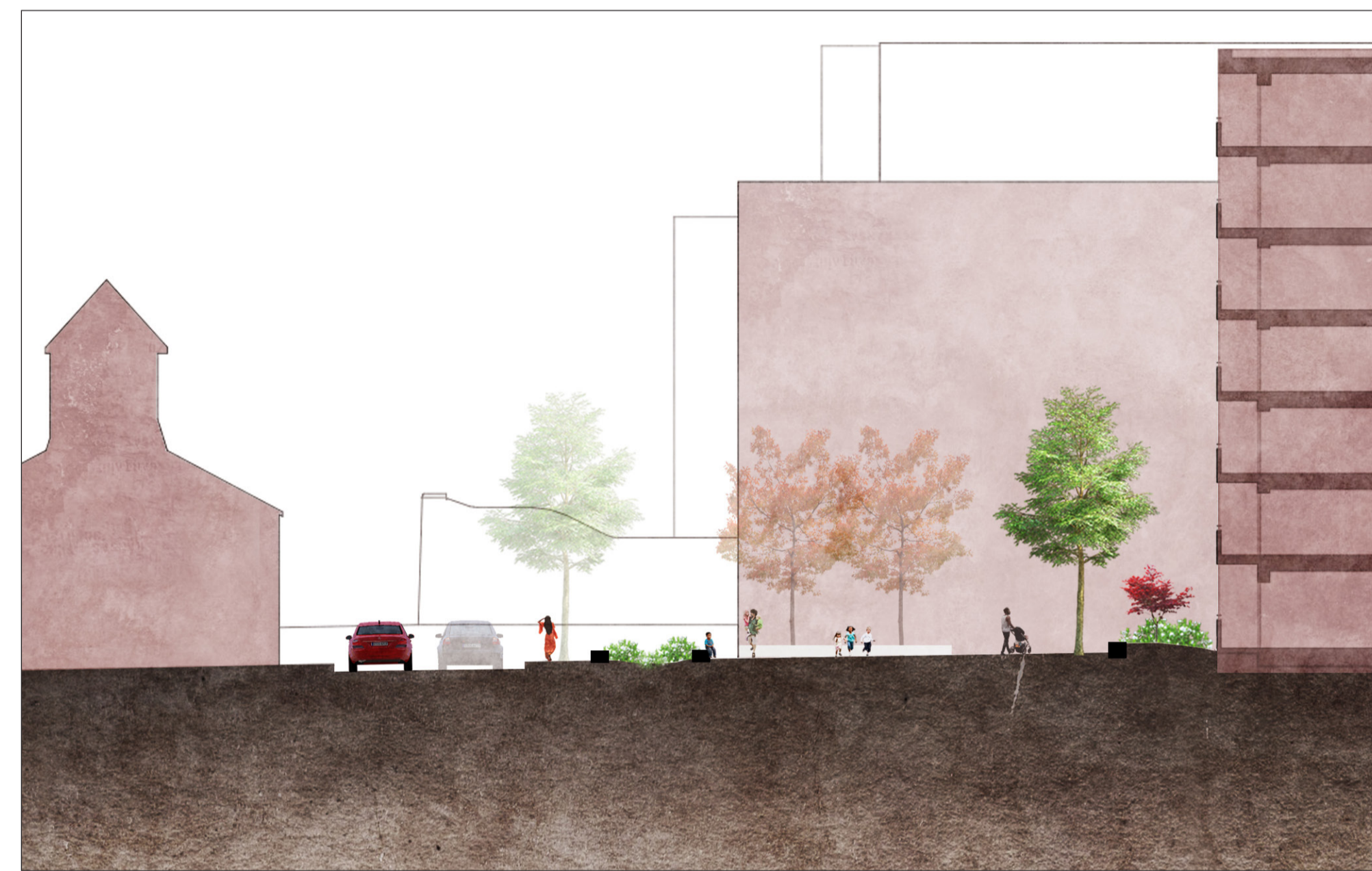
Section E: Richmond Place (Short)